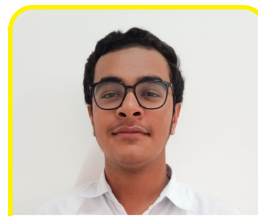
VIDHIT 1st Position in Instrumental (Harmonium ) Comp. at District Level