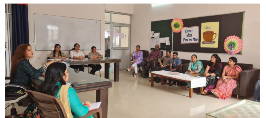
The Principal Delhi Public School Ballabgarh discussing the issues with the Parents During Parent Educator Meet

The result comes as a testimony of the hard work and opens up the doors for a brighter future for them. The teachers briefed the parents about their ward's performance during exams. Together they identified the areas of strength and weakness of the child and sorted out ways to boost the child's performance. Parents were encouraged to appreciate