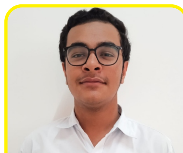
VIDHIT 1st Position in Solo Singing Comp. at Zonal Level